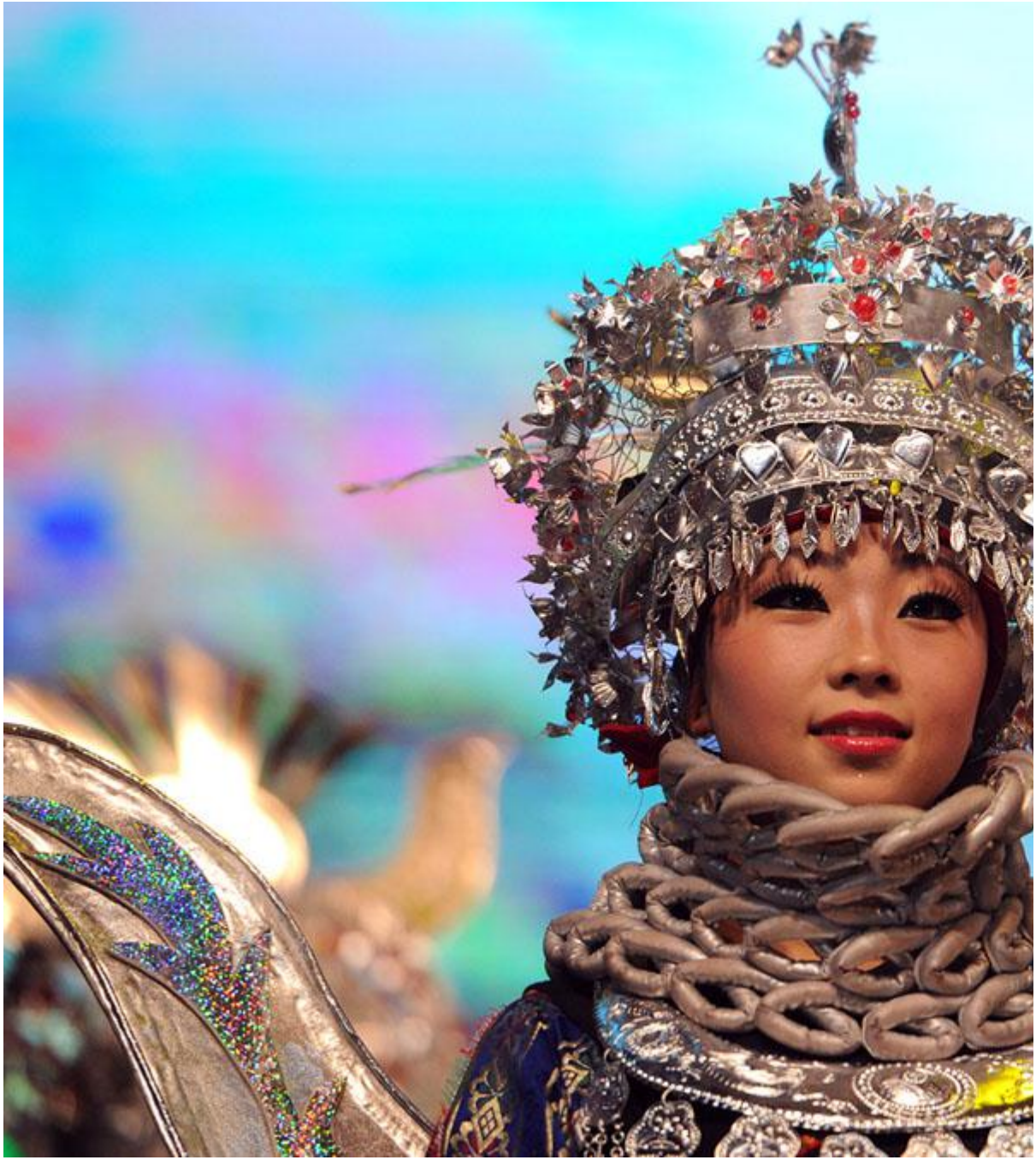
A Chinese ethnic minority dancer performs a song and dance routine entitled, "Colourful Guizhou" in Guiyang, Guizhou province, on June 10, 2012.