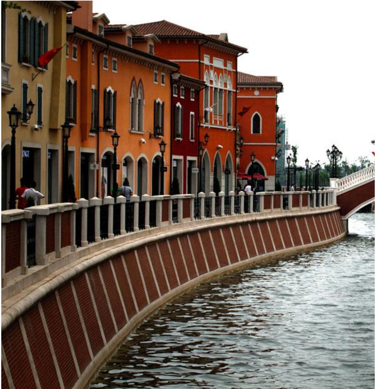
A bridge crosses a canal that flows through the center of the Florentia Village in the district of Wuqing, located on the outskirts of the city of Tianjin, on June 13, 2012. The shopping center, which replicates old Italian-style architecture, covers an area of some 200,000 square meters, and was constructed on a former corn field at an estimated cost of US$220 million.