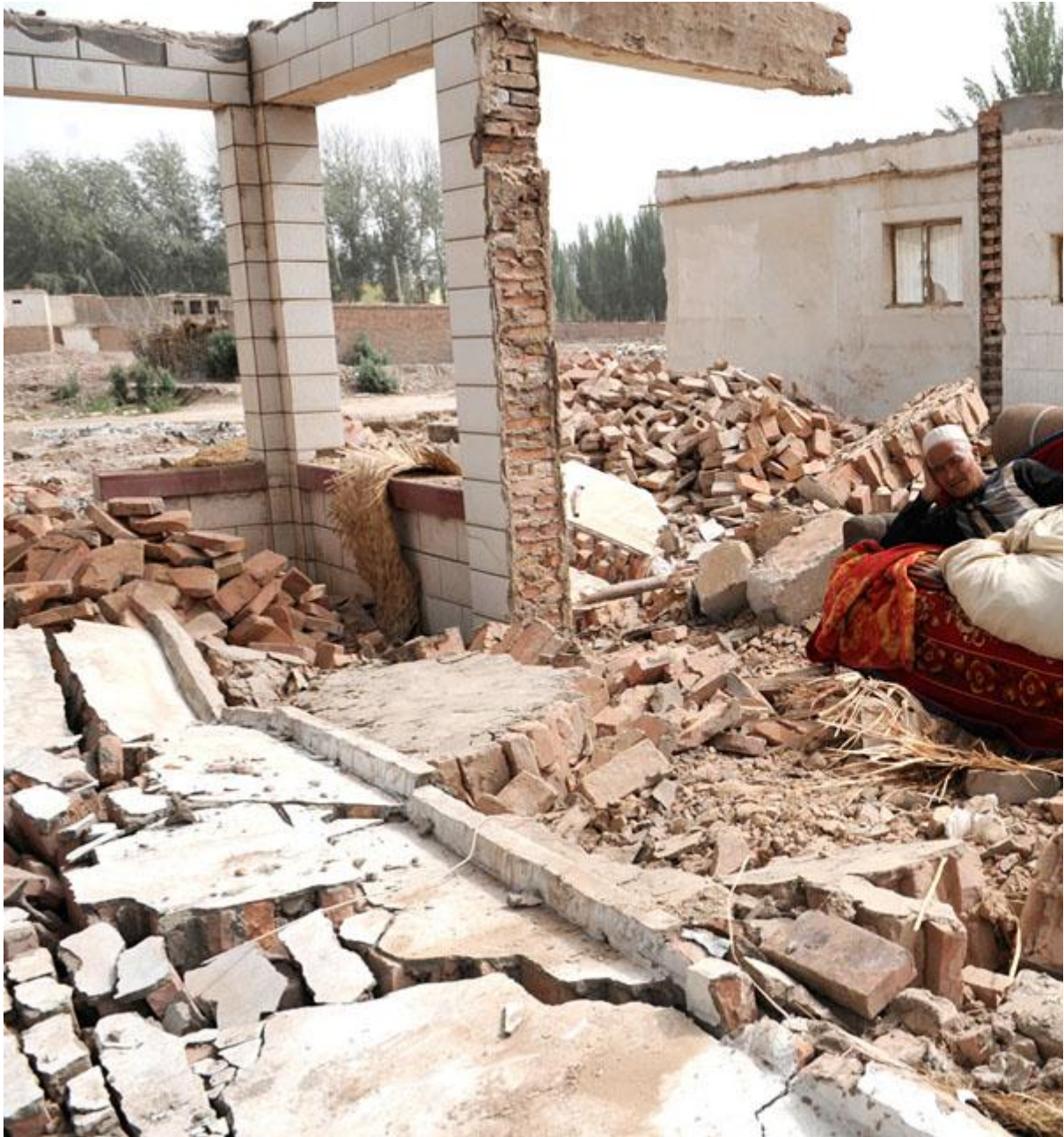
An ethnic Uighur man lies on a couch as he keeps an eye on his belongings at his newly-demolished house, which made way for a residential complex in Aksu, Xinjiang Uighur Autonomous Region, on May 13, 2012.