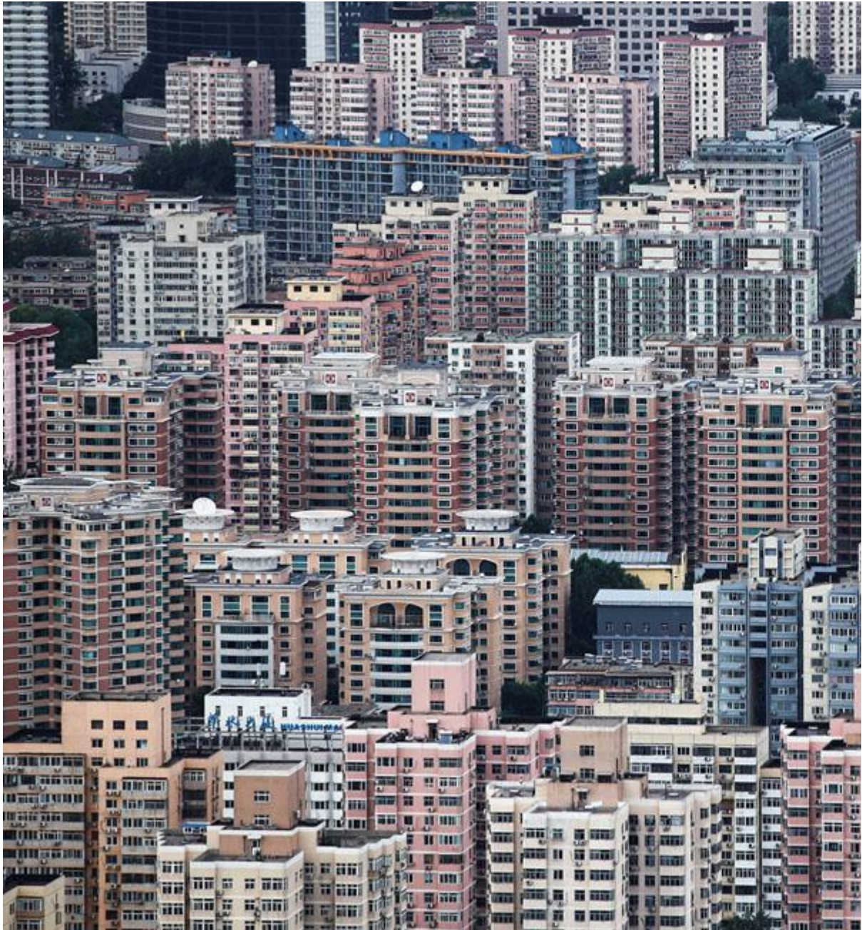
Part of the vast skyline of Beijing, China, seen on June 12, 2012. Beijing is the capital of the People's Republic of China and one of the most populous cities in the world, with a population estimated at over 19 million people as of 2010.