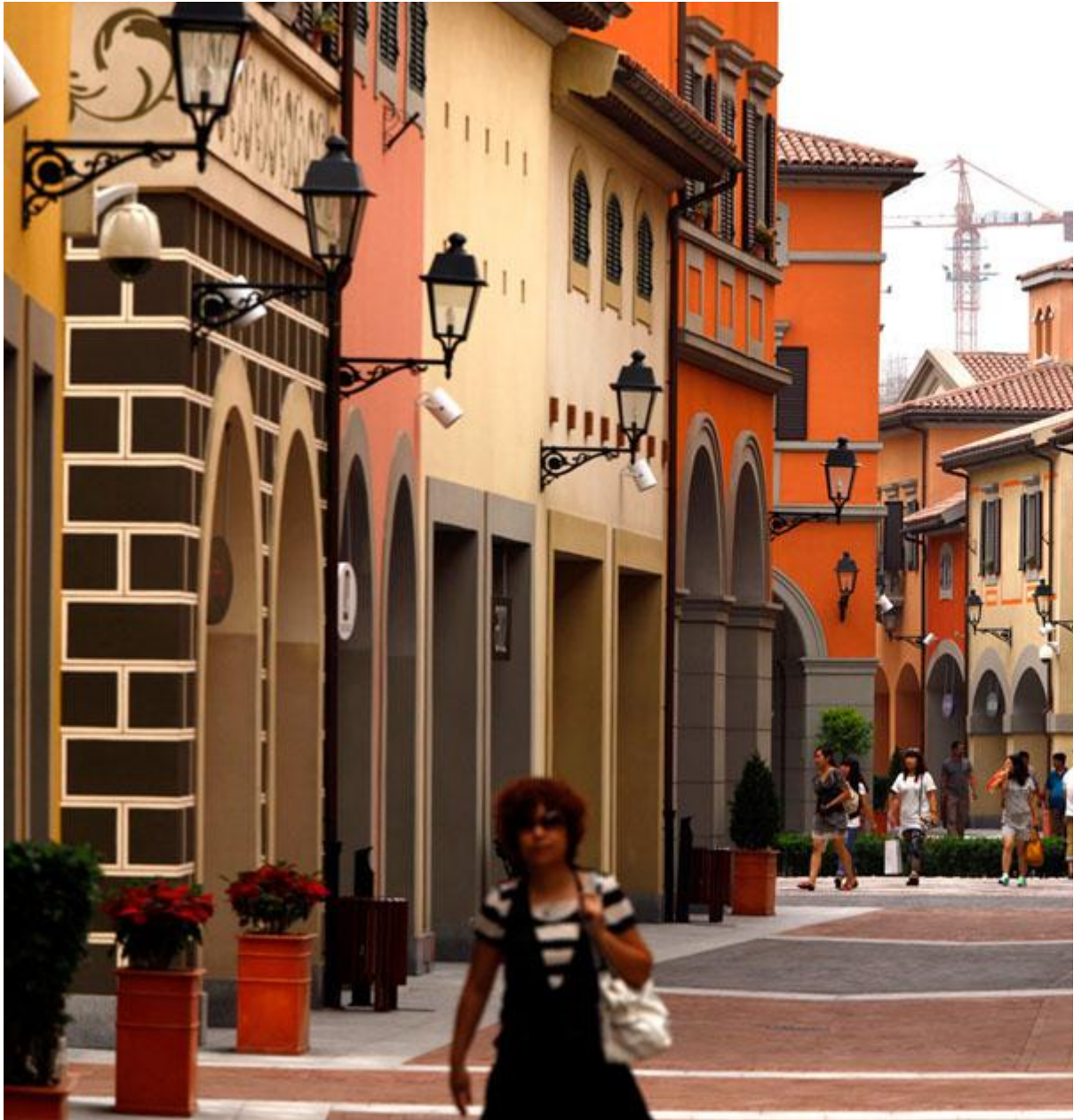
Pedestrians walk down an alley that resembles a Florentine-style street in the Florentia Village in the district of Wuqing, on June 13, 2012. The shopping center copies old Italian-style architecture with Florentine arcades, a grand canal, bridges, and a building that resembles a Roman Colosseum.