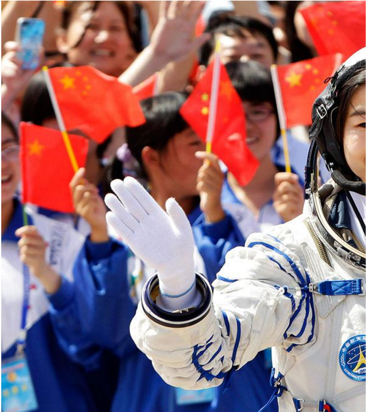
Liu Yang, China's first female astronaut, waves during a departure ceremony at Jiuquan Satellite Launch Center, Gansu province, on June 16, 2012. China sent its first woman taikonaut into outer space this week, prompting a surge of national pride as the rising power takes its latest step towards putting a space station in orbit within the decade. Liu, a 33-year-old fighter pilot, joined two other taikonauts aboard the Shenzhou 9 spacecraft when it lifted off from a remote Gobi Desert launch site.