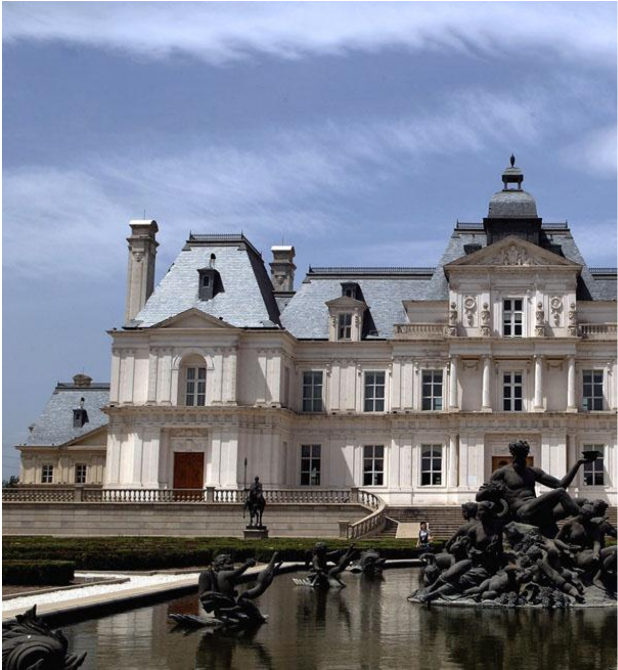
A multi-million dollar replica of France's historic Chateau Maison-Laffitte, the Beijing Laffitte Chateau, photographed on June 12, 2012. The Chateau, a luxury hotel, spa and wine museum, is located on the outskirts of Beijing.