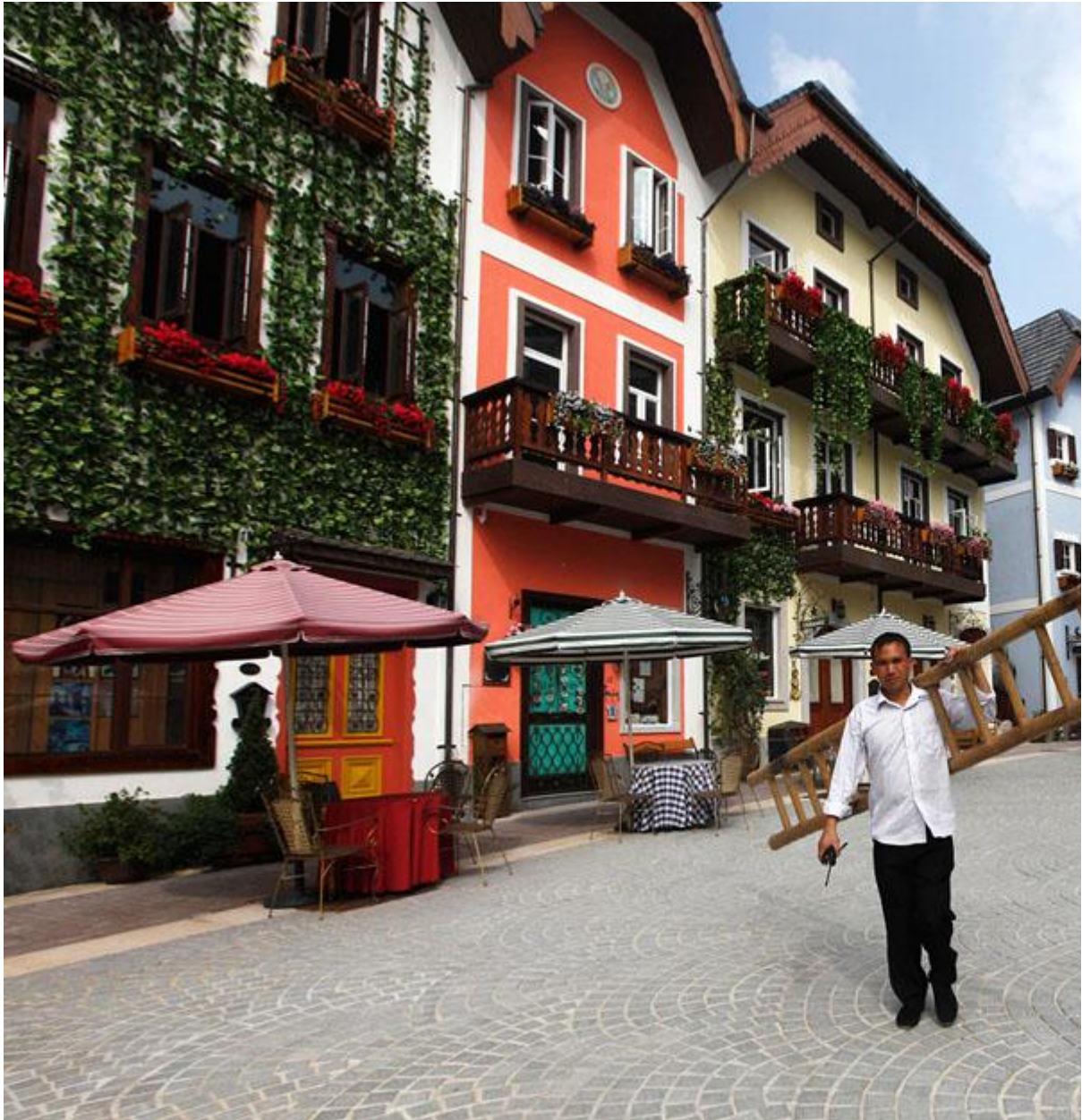
A construction worker walks with a ladder in the replica village of Austria's UNESCO heritage site, Hallstatt, in China's southern city of Huizhou, on June 1, 2012. Metals and mining company China Minmetals Corporation spent $940 million to build this controversial site and hopes to attract both tourists and property investors alike, according to local newspaper reports.