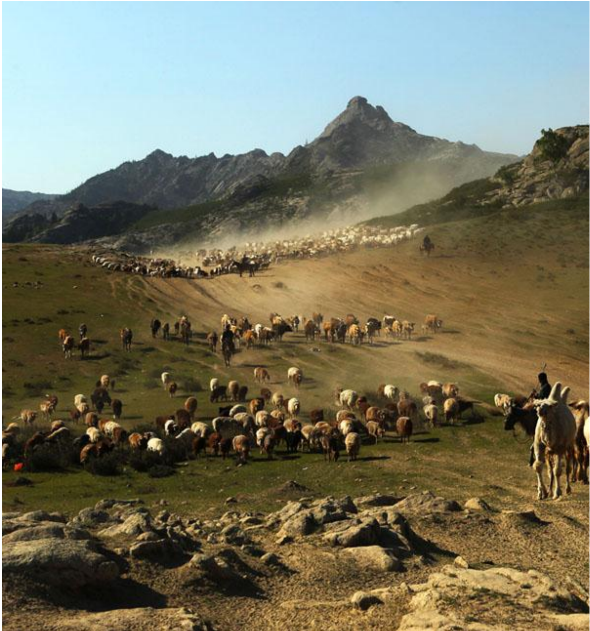
Kazakh nomads herd their livestock in a caravan across a plain in Altay, far west China's Xinjiang region, on June 2, 2012. The Altay, known in Chinese as the Aletai region, is situated in the most northern part of Xinjiang, sharing a border on the east with Mongolia and on the west with Russia.