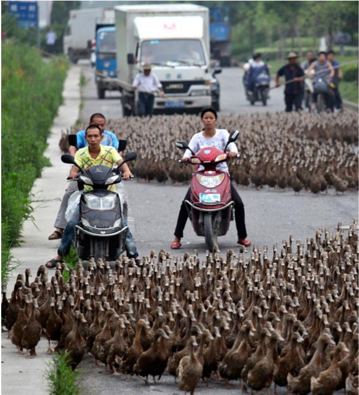
Farmers herd a flock of ducks along a street towards a pond as residents drive next to them in Taizhou, Zhejiang province, on June 17, 2012.