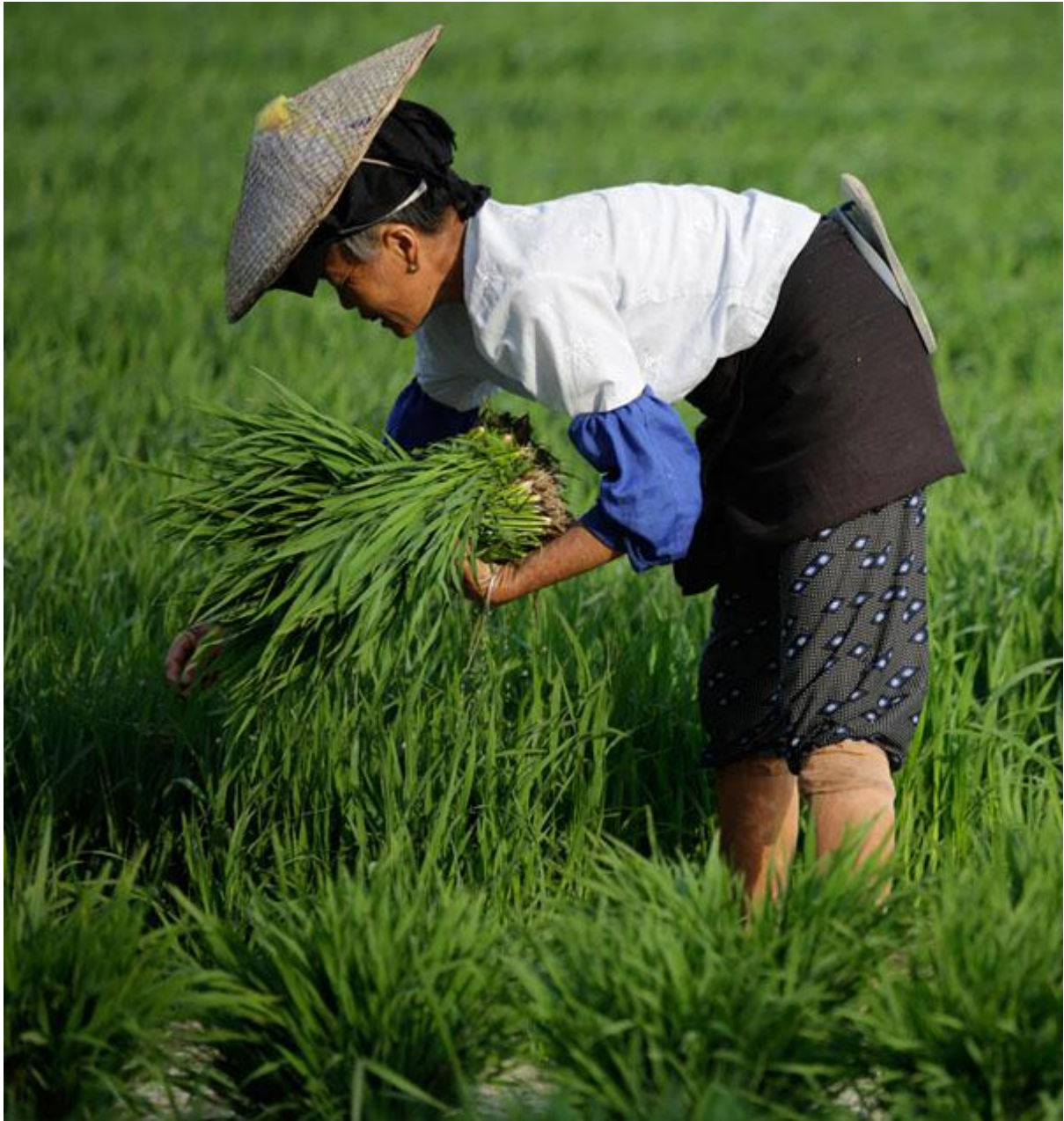
A woman plants rice in Yingjiang, near the Myanmar border, in Yunnan Province, China, on May 26, 2012. Many still expect that the lifting of U.S. and European Union economic sanctions against Myanmar will boost trade from China's industrial regions through Ruili and other border areas in Yunnan, a mostly mountainous province that has close ties with all its Southeast Asian neighbors.