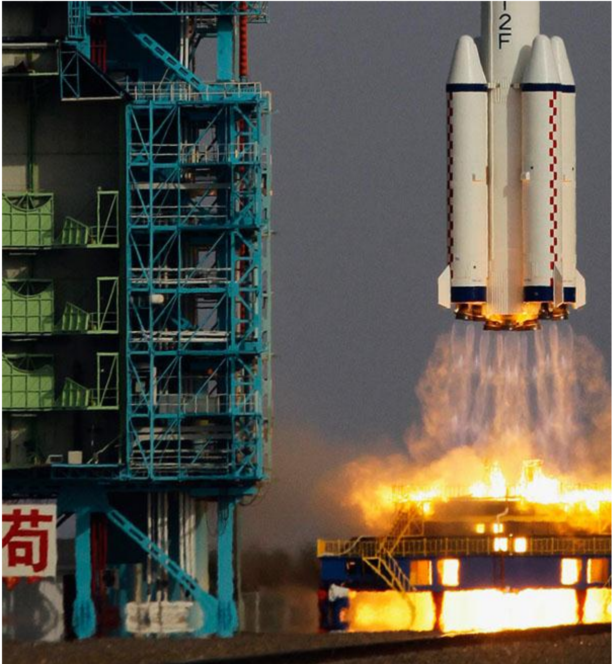
The Long March II-F rocket loaded with a Shenzhou-9 manned spacecraft carrying Chinese astronauts Jing Haipeng, Liu Wang and Liu Yang lifts off from the launch pad in the Jiuquan Satellite Launch Center, on June 16, 2012. China launched the spacecraft putting its first woman, 33-year-old female fighter pilot Liu Yang, in orbit.