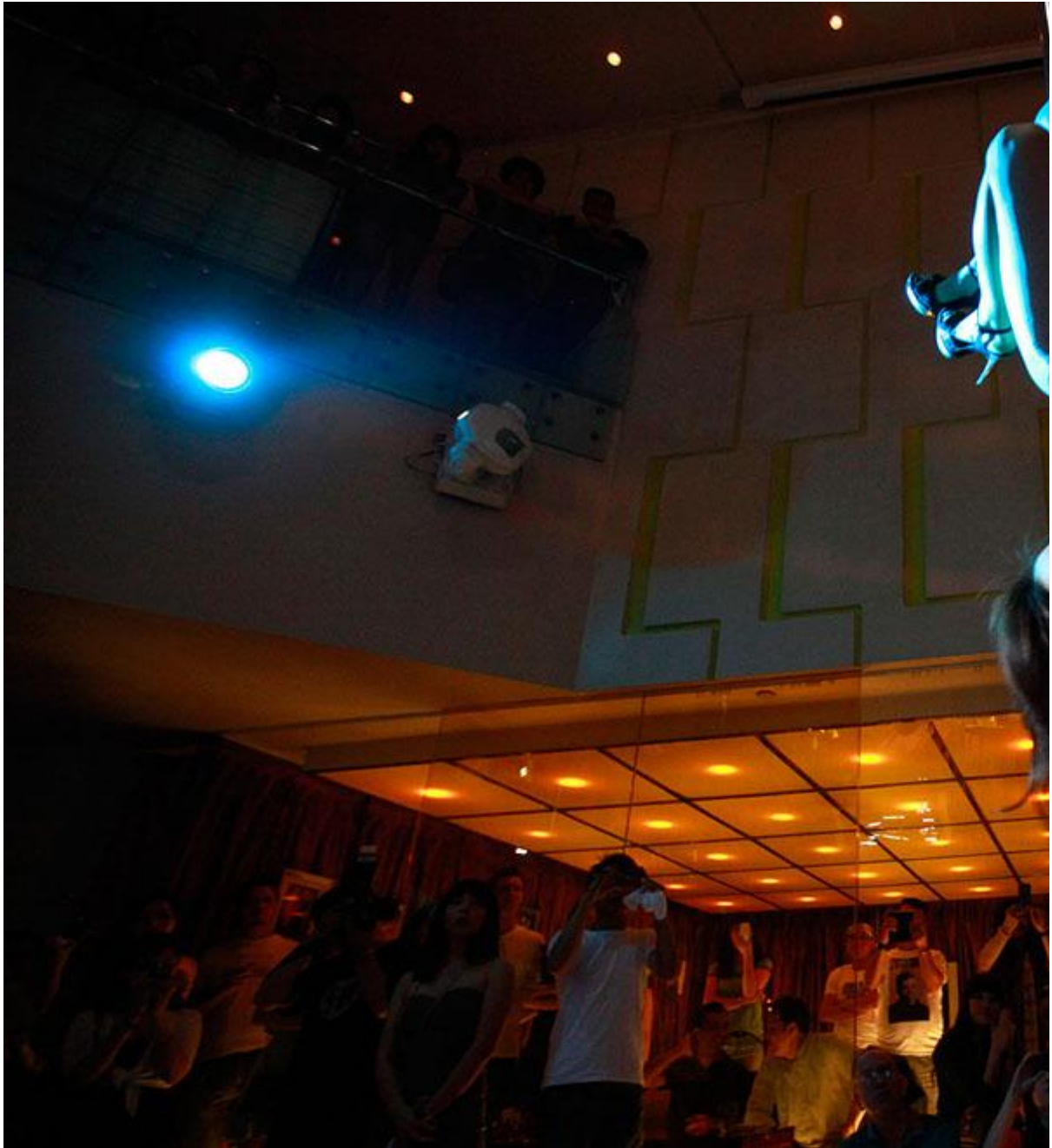
A contestant takes part in a pole dancing competition held in Beijing, on May 26, 2012.