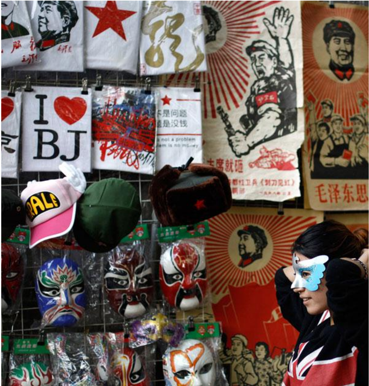
A vendor puts on a mask while awaiting customers in Beijing, on May 14, 2012.