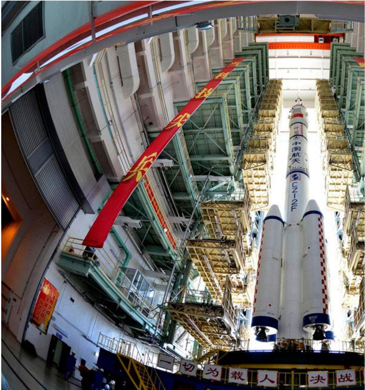
The Shenzhou-9 manned spacecraft, Long March-2F rocket, and escape tower wait to be transferred to the launch pad at the Jiuquan Satellite Launch Center, Gansu province, on June 9, 2012.