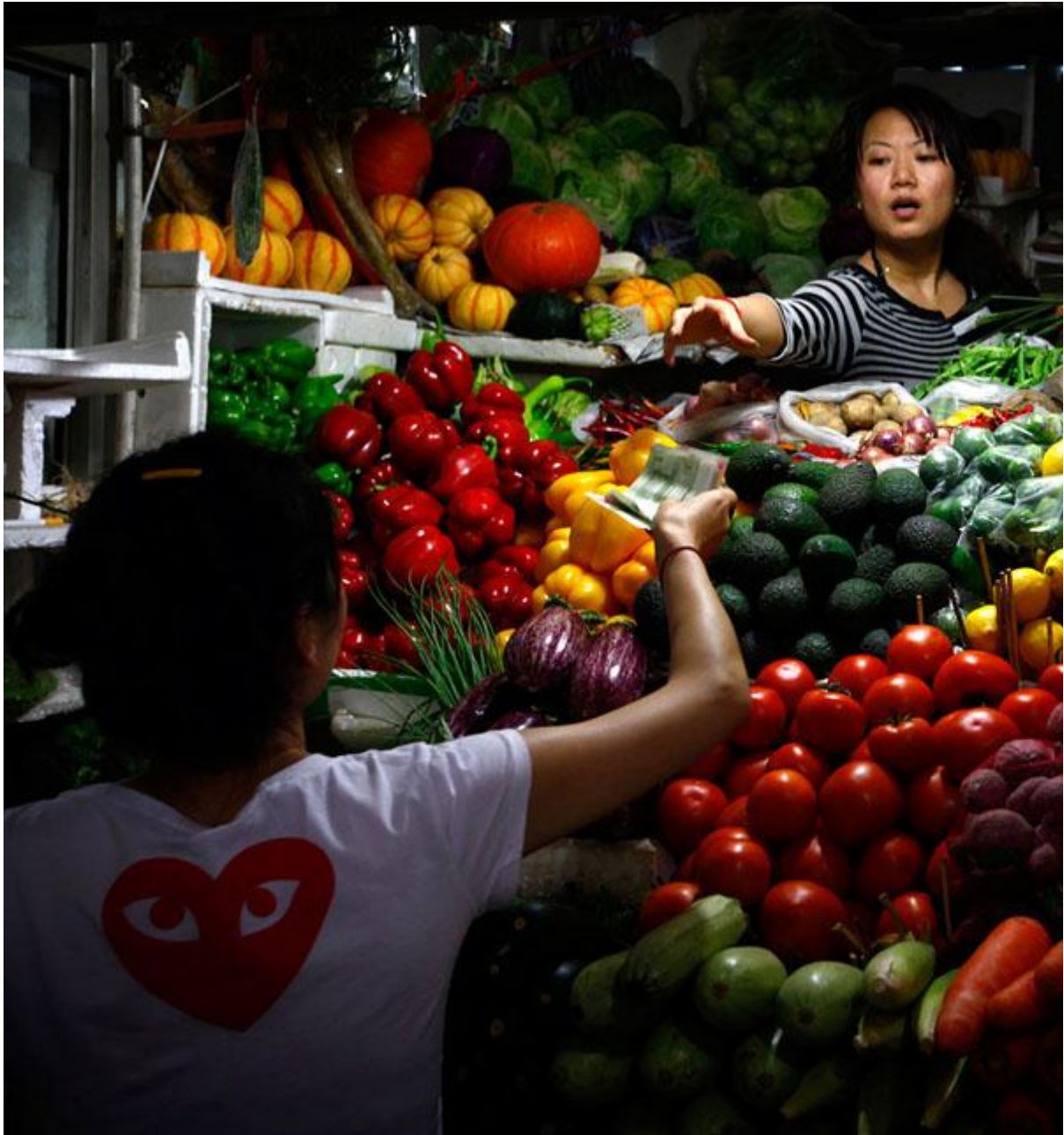
A vegetable seller reaches to collect money from a customer in her stall at a market in central Beijing, on June 1, 2012. China's inflation rate in May is likely to fall to around 3.2 percent from a year earlier due to a decline in vegetable prices state media reported this week, with China's annual economic growth expected by analysts to fall to 7.9 percent in the second quarter, the first dip below 8 percent since 2009.