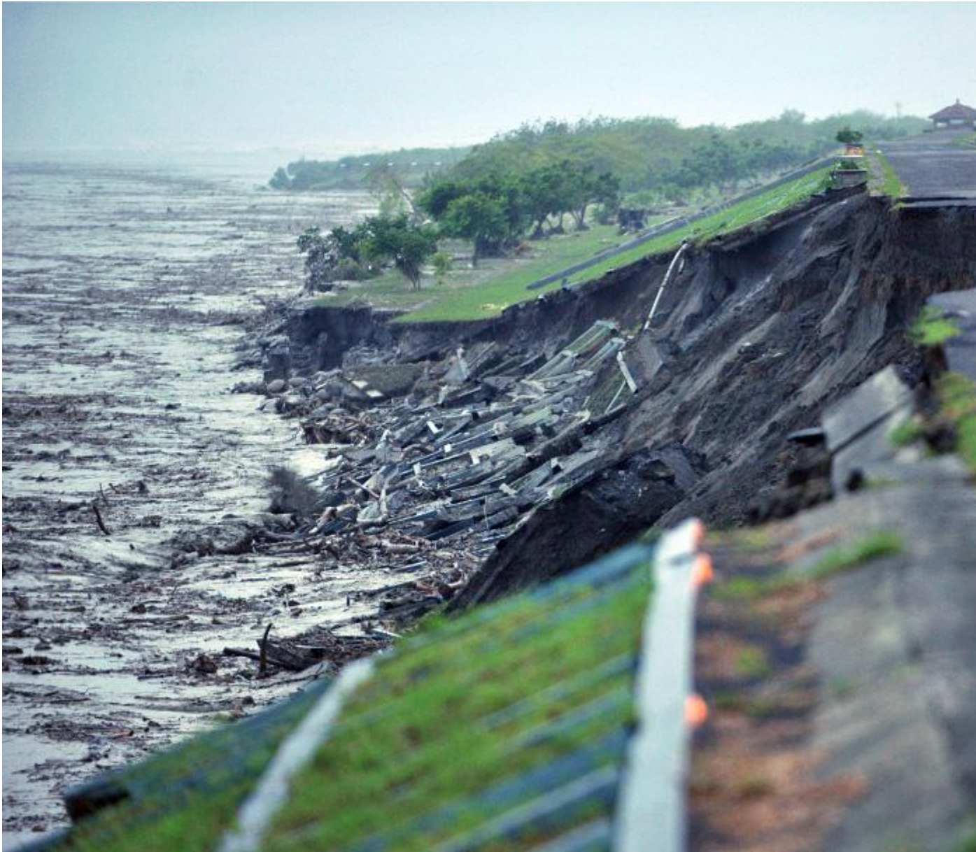
Z Water flows past a severely eroded embankment near a damaged bridge that previously linked Pingtung and Kaohsiung , in southern Taiwan on August 9, 2009. (SAM YEH/AFP/Getty Images) #