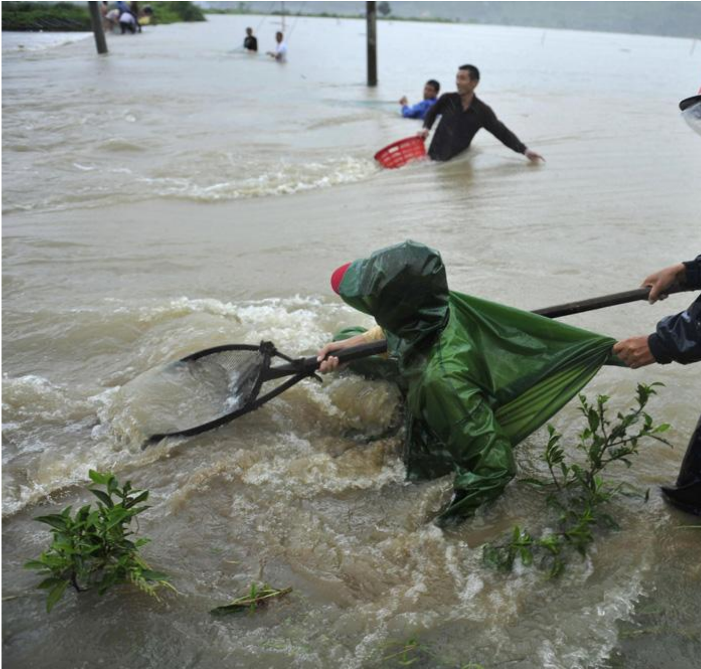
34 Local residents try to catch fish at a flooded fish pond as Typhoon Morakot approaches in Xiapu county of Ningde , Fujian province, China on August 9, 2009. #