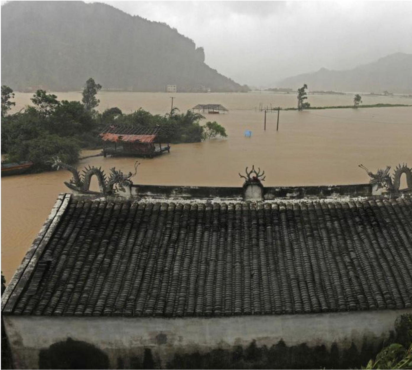
30 Paramilitary policemen pilot a motorboat through a flooded village in Cangnan county, eastern China Sunday Aug. 9, 2009. #