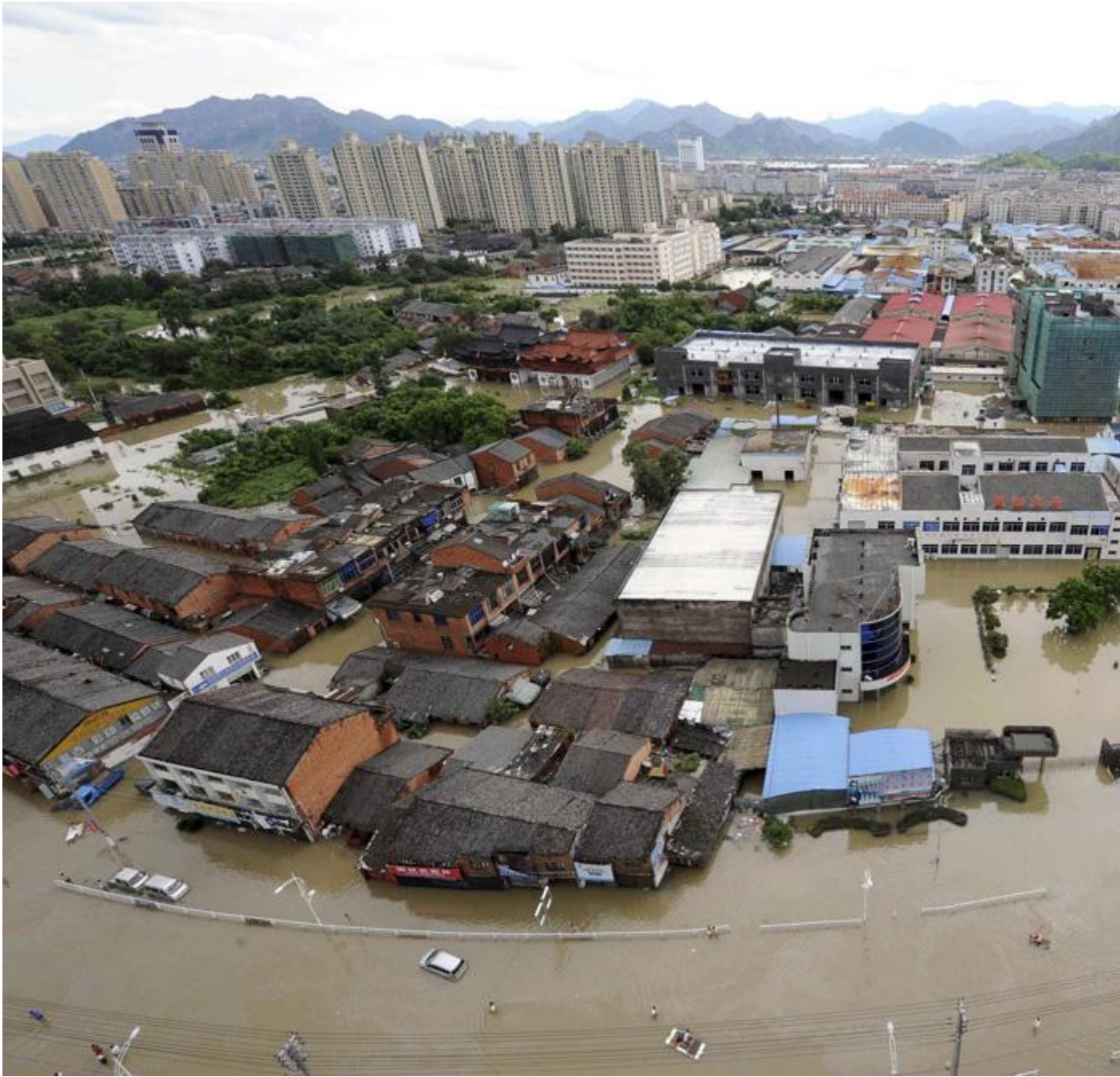
11 A flooded area of Cangnan county of Wenzhou , Zhejiang province, China after Typhoon Morakot passed by, on August 10, 2009. #