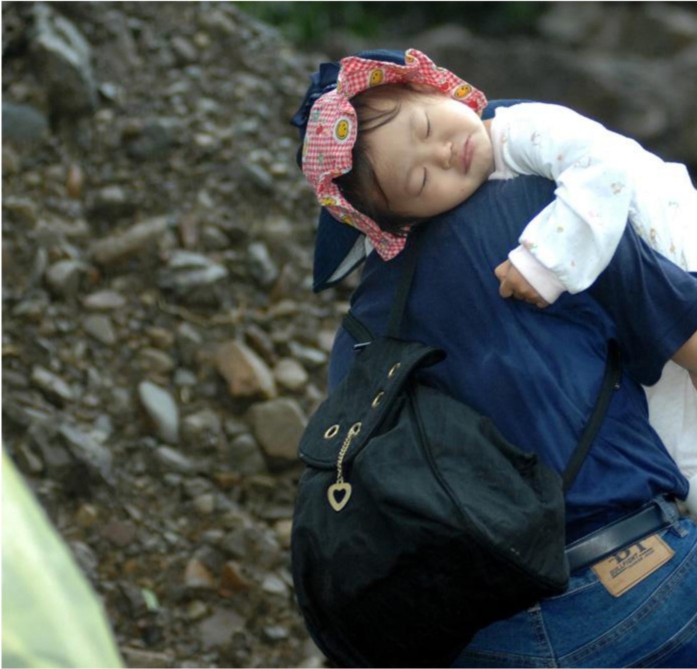
16 A girl is carried out from mudslide caused by Typhoon Morakot in Chiashien, Kaohsiung county, in southern Taiwan , on August 10, 2009. #