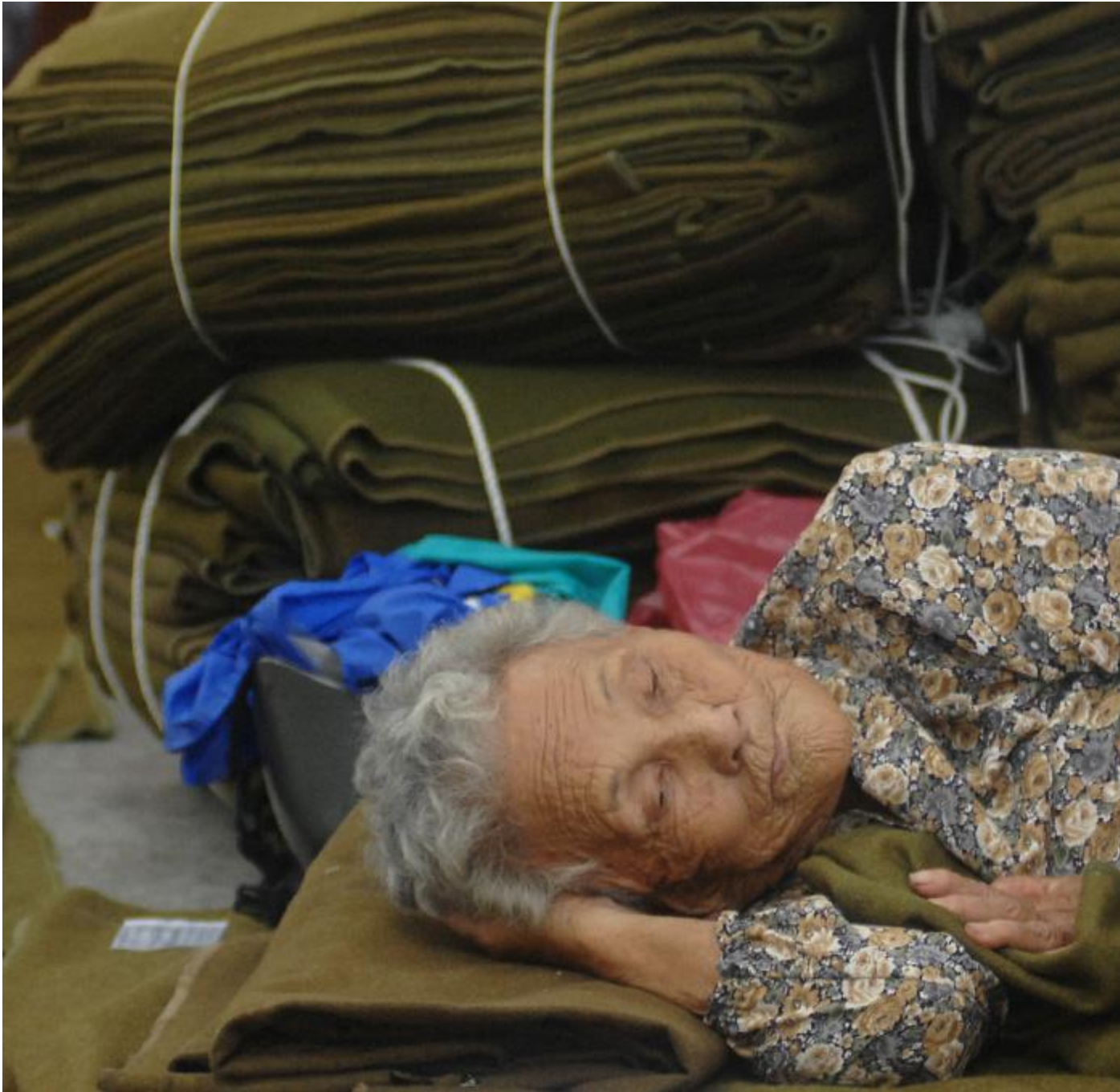
14 A woman, taking shelter from Typhoon Morakot, rests in a temporary evacuation centre in Chiatung, in southern Taiwan 's Pingtung county on August 9, 2009. #