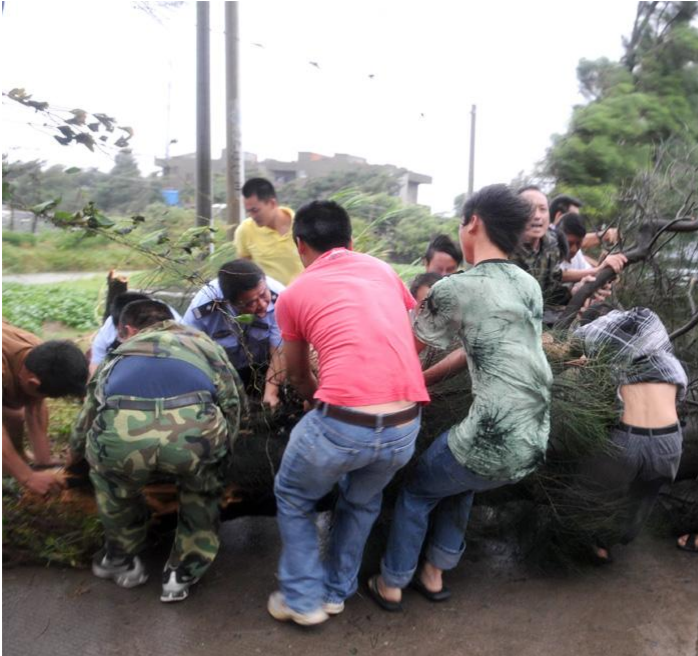
5 Residents gather to remove a fallen tree blocking a road in Changle, in southeast China 's Fujian province on August 8, 2009 as Typhoon Morakot hits mainland China . #