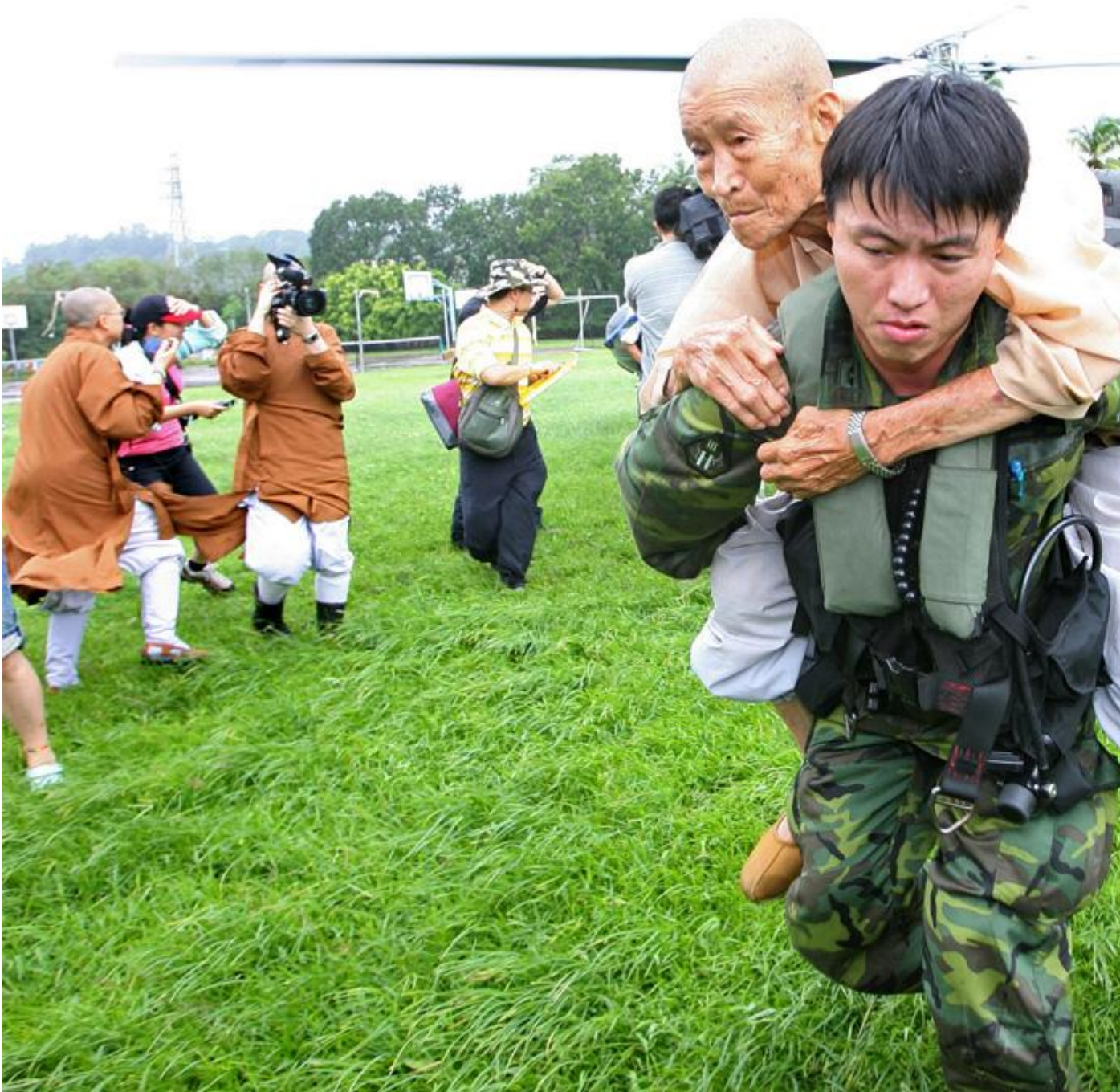
6 An elderly man is carried from a helicopter to a high school in Chishan, in Taiwan 's Kaohsiung county on August 10, 2009 after being airlifted from the southern village of Shiao Lin. #