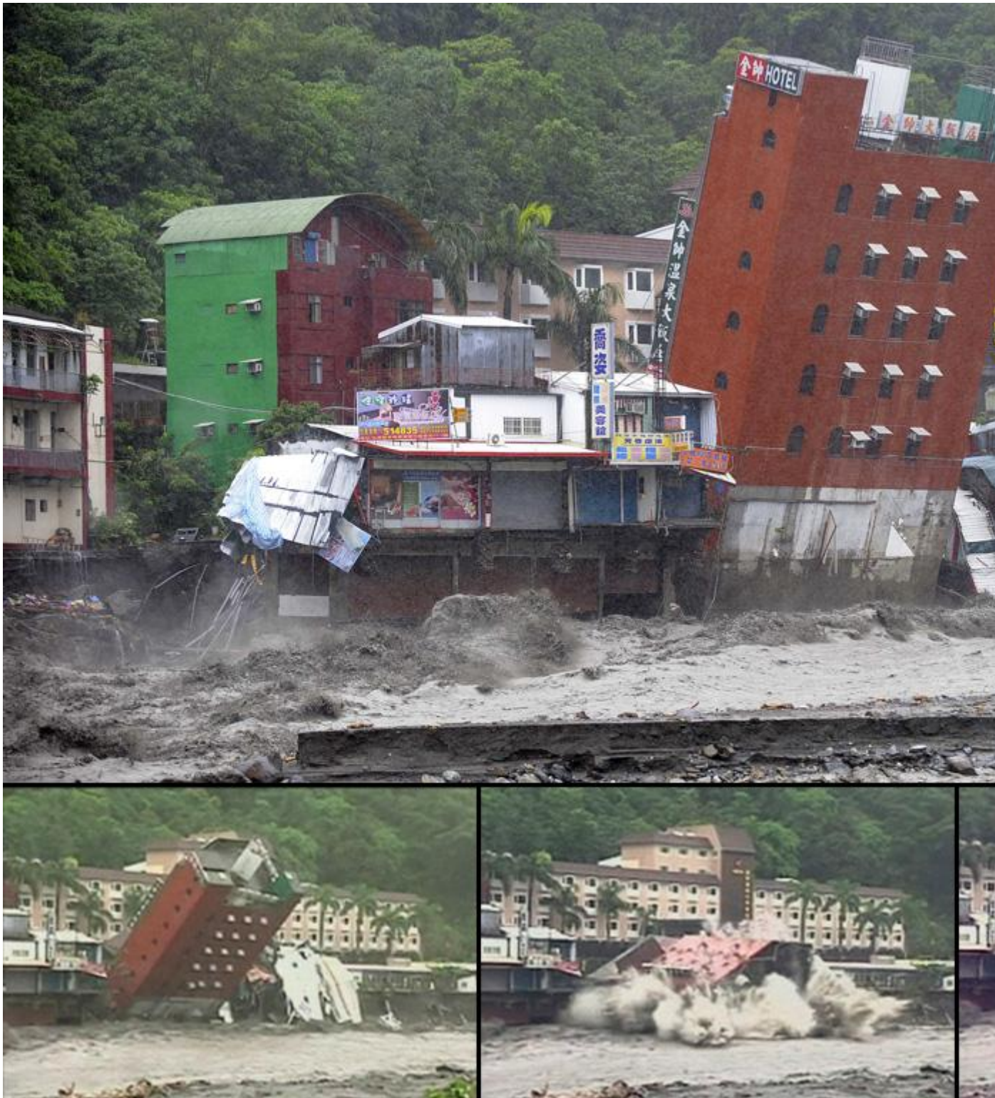
9 A hotel building leans before falling in a heavily flooded river after Typhoon Morakot hit Taitung county, Taiwan , Sunday, Aug. 9, 2009. The six-story hotel collapsed and plunged into the river Sunday morning after floodwaters eroded its base - all 300 people in the hotel had been evacuated and uninjured, officials said. (AP Photo / AP Photo/ETTV Television) #