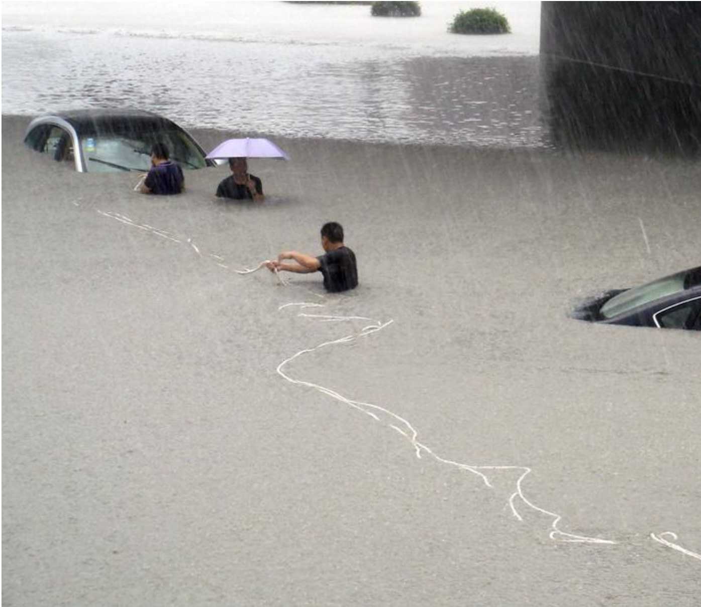
27 Rescuers try to pull a stranded car out of floodwater in Wenzhou , Zhejiang province, China on August 9, 2009. #