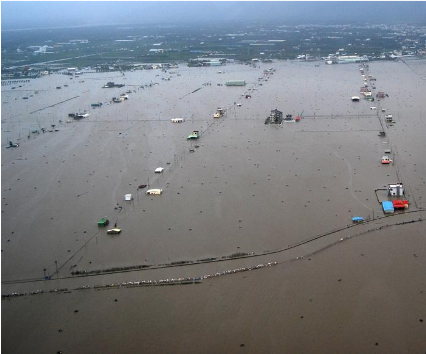
23 An aerial view of flooding caused by Typhoon Morakot in Chiatung, Taiwan. (AFP/AFP/Getty Images) #