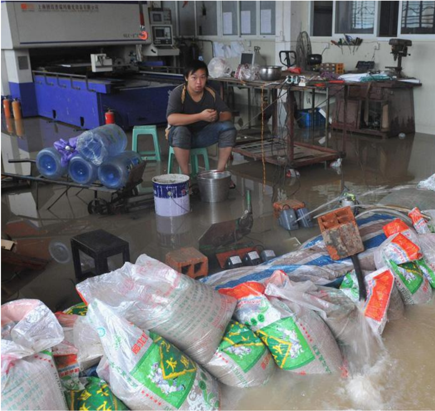
33 A worker sits behind a pile of sandbags as pumps empty floodwater from a workshop after Typhoon Morakot hit Fuzhou , Fujian province August 9, 2009. #