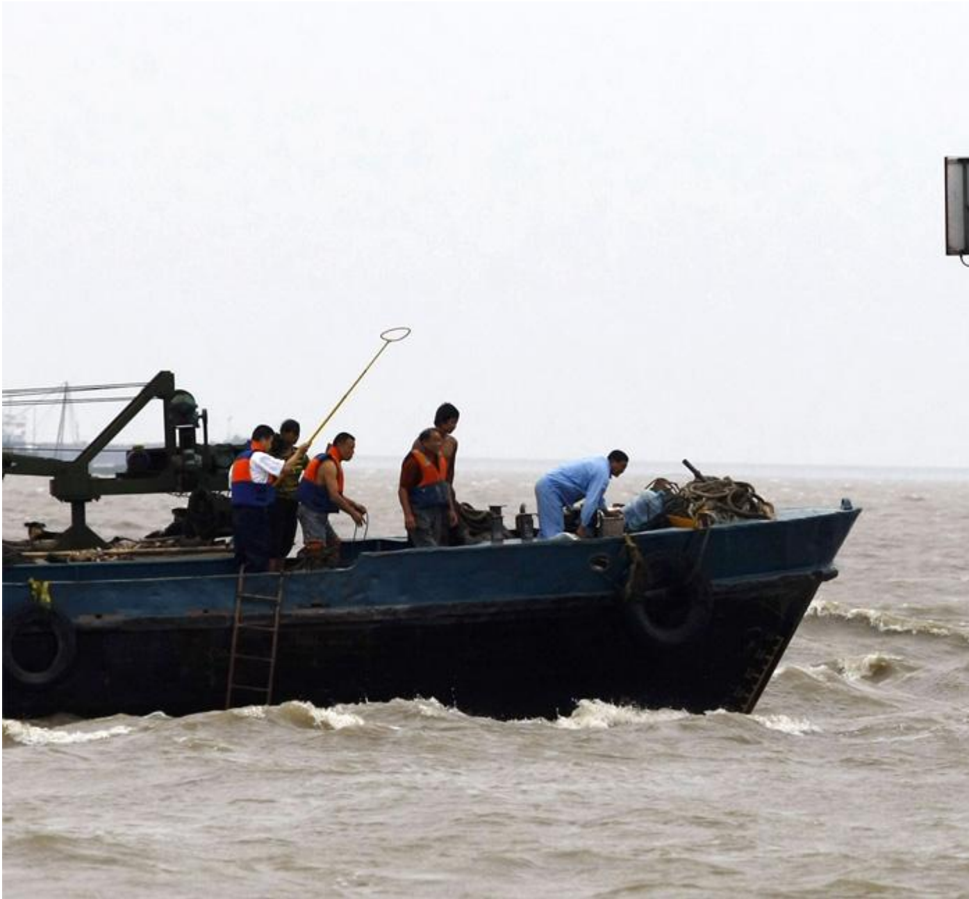
19 Rescuers try to reach a man who is stranded by floods as Typhoon Morakot approaches in Shanghai , China on August 9, 2009. #