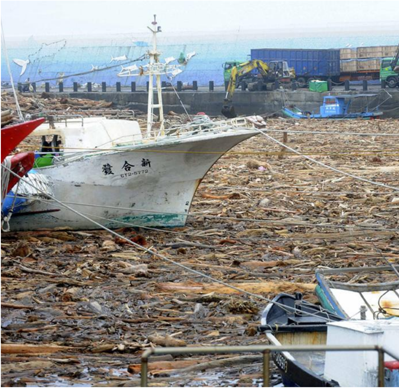
28 Driftwood and debris fills Fugang Harbor after Typhoon Morakot hit Taitung county, eastern Taiwan , Sunday, Aug. 9, 2009. #