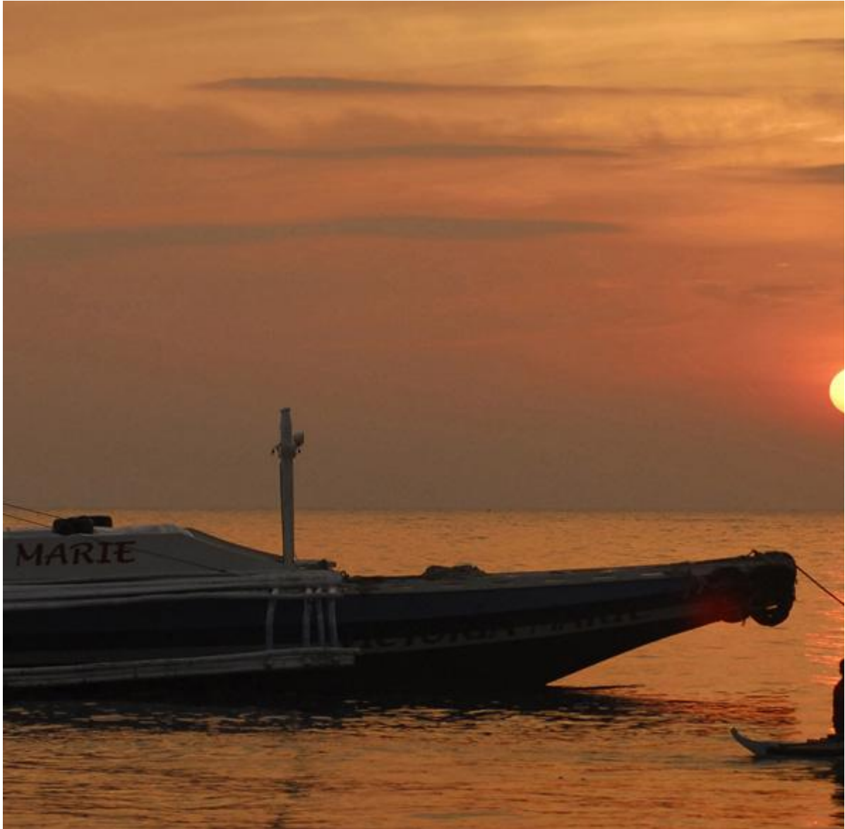
2 A fisherman paddles his canoe past a fishing vessel during sunrise as the weather clears after continued rain brought by Typhoon Morakot stopped in the central Philippine island of Cebu August 9, 2009. #