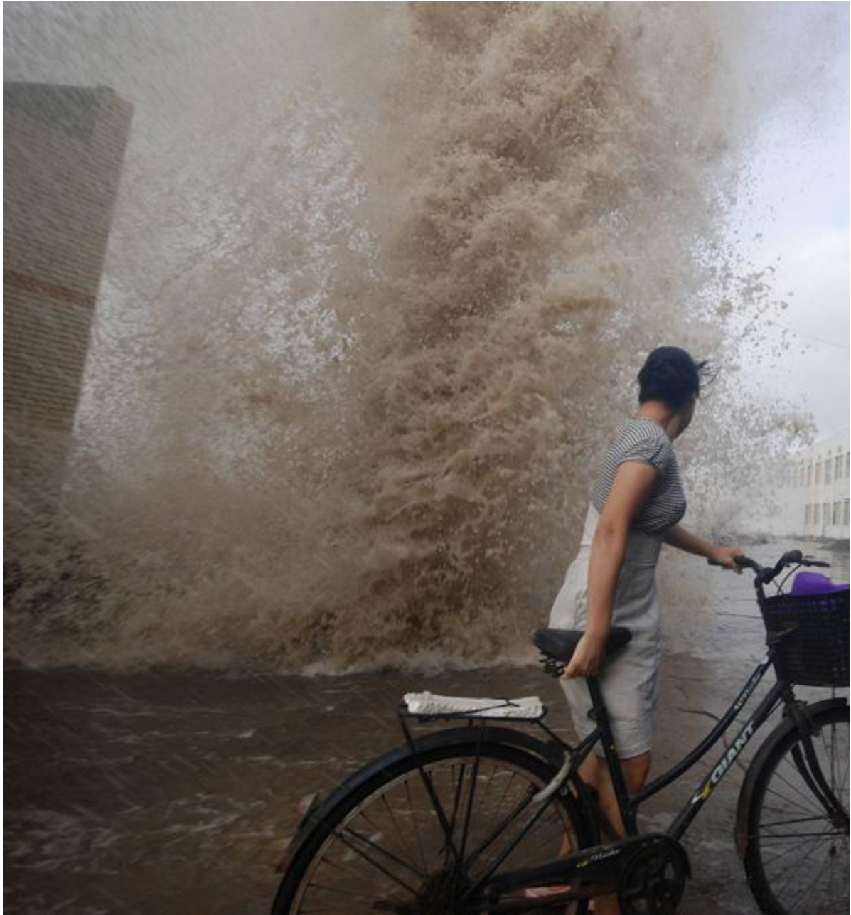
A woman watches waves triggered by Typhoon Morakot batter the shore in Wenling , Zhejiang Province August 7, 2009.