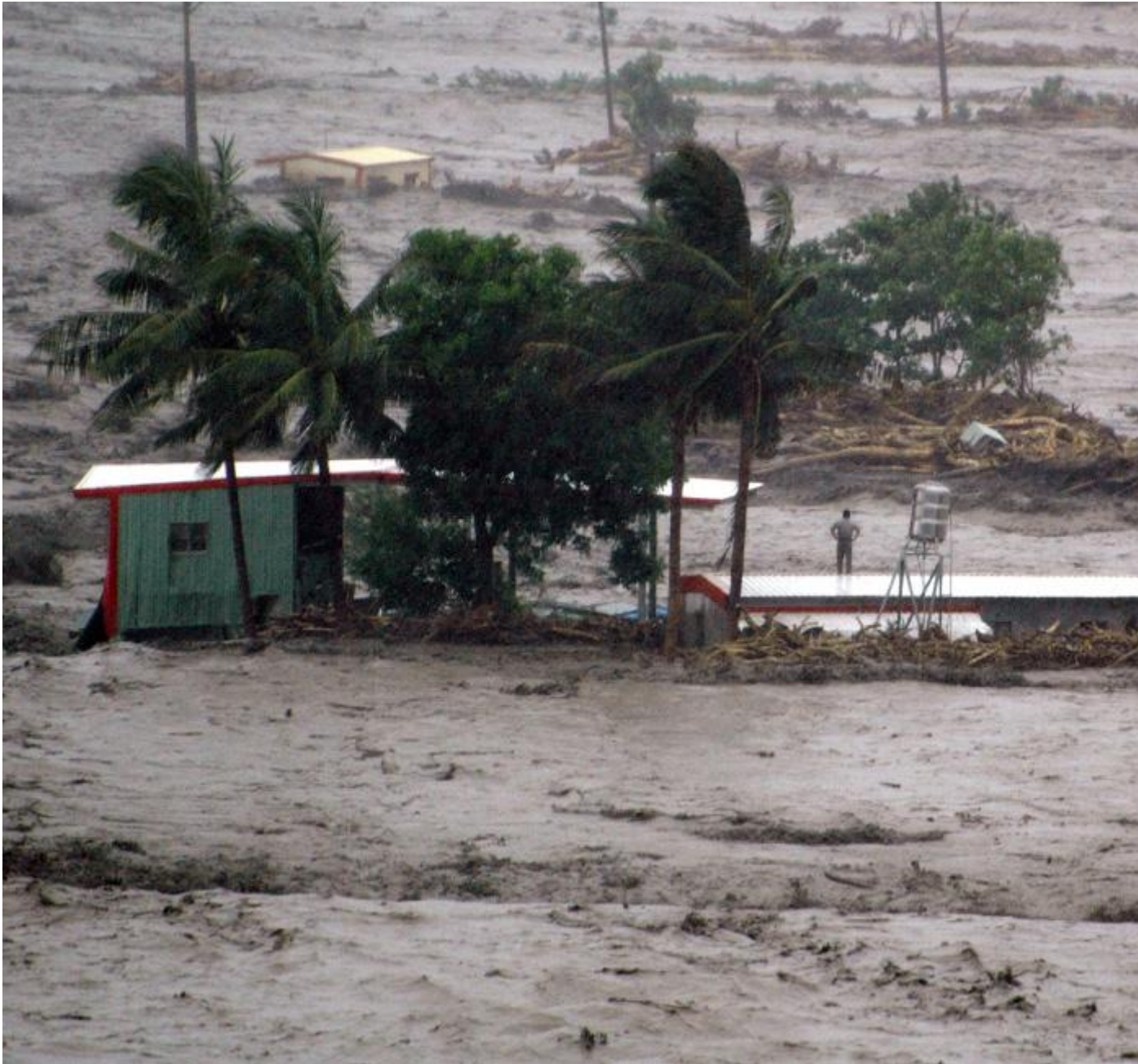
8 A man stands on a roof as he awaits rescue in heavy flooding in Taimali, south-eastern Taiwan 's Taitung county on August 8, 2009 during Typhoon Morakot. #