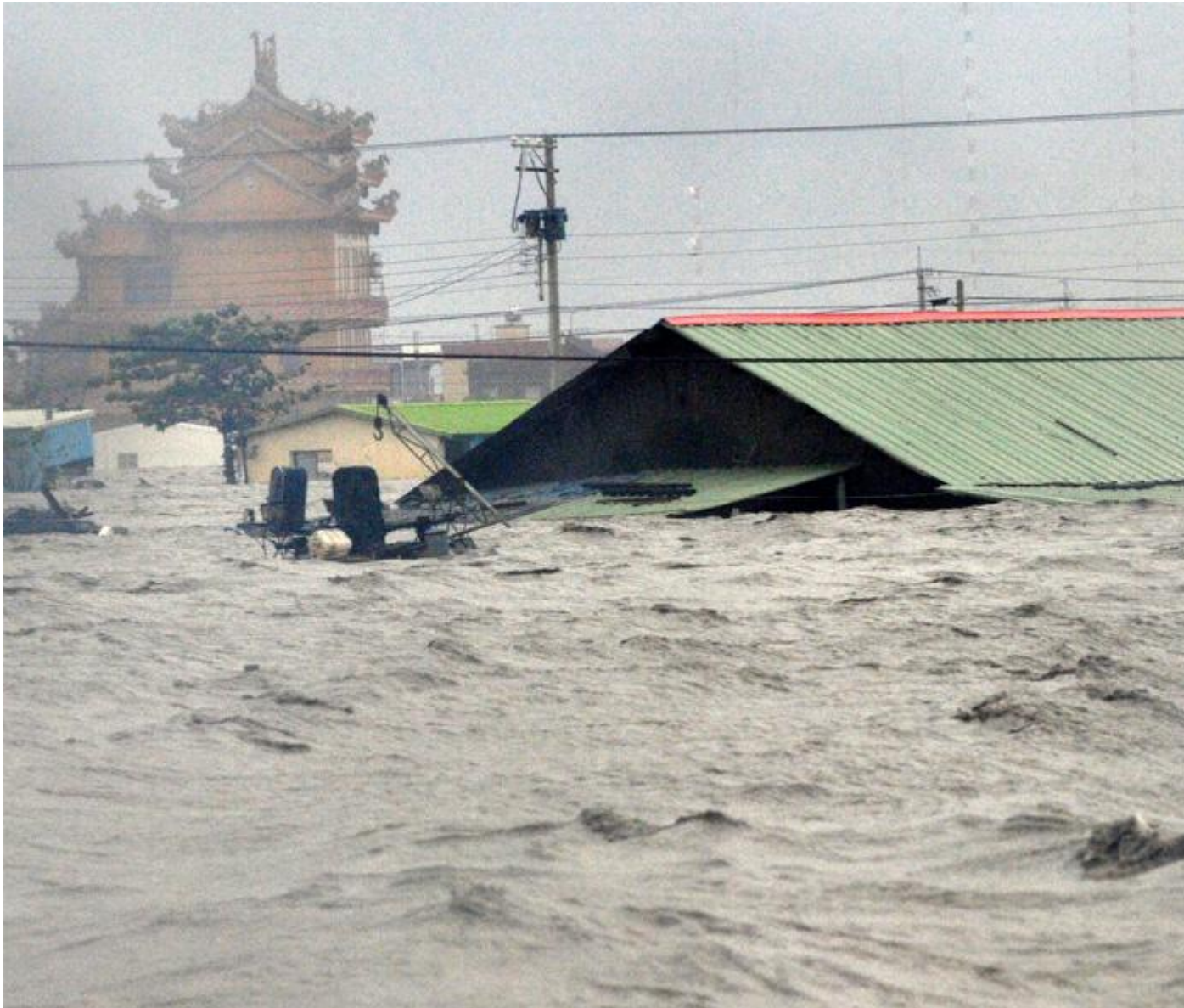
4 Flood waters brought by Typhoon Morakot submerge a house in Chiatung, Pingtung county, in southern Taiwan , on August 9, 2009 . (SAM YEH/AFP/Getty Images) #