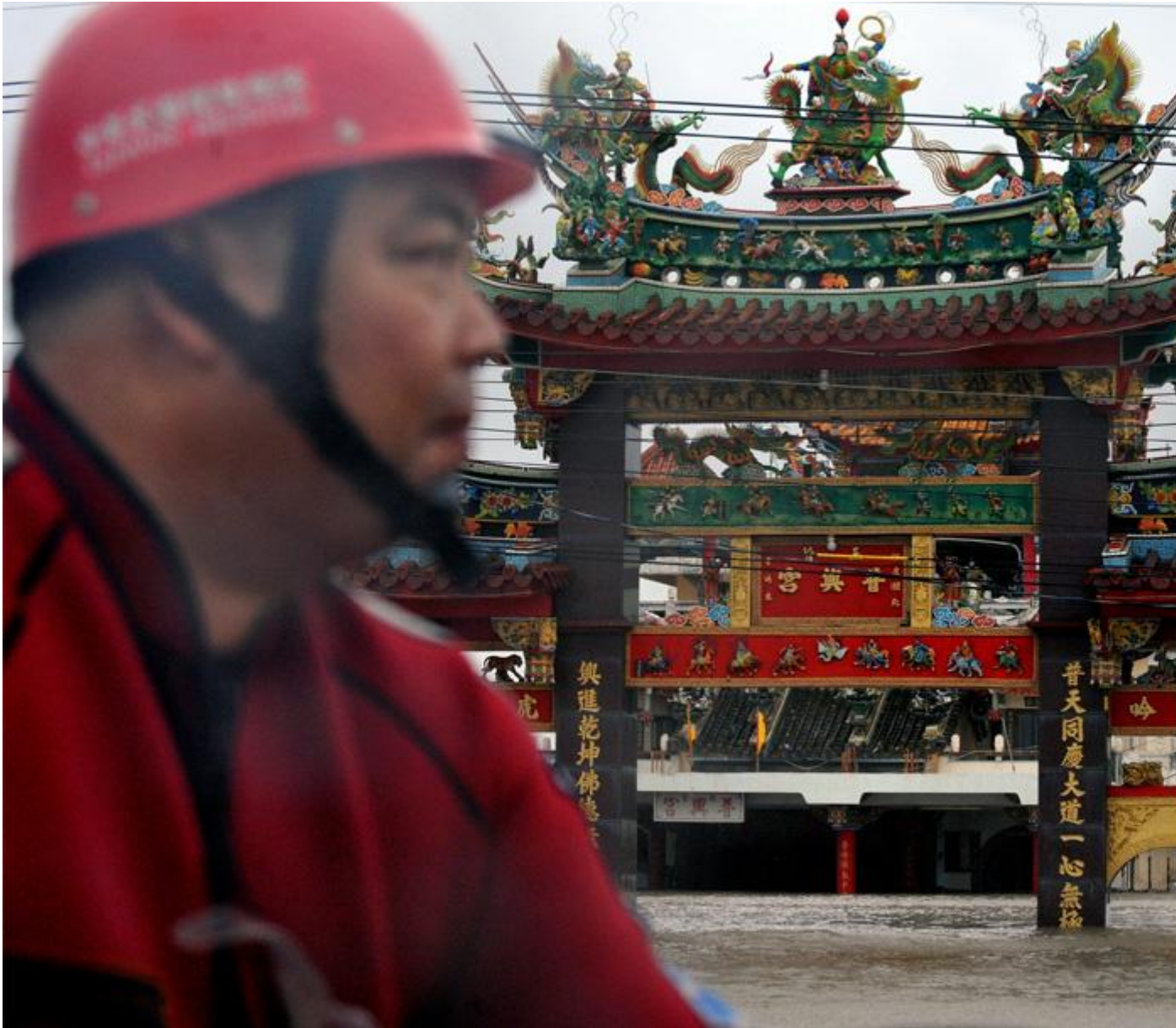
15 Rescuers are seen before a Taoist temple inundated in floodwaters brought by Typhoon Morakot in Chiatung, southern Taiwan , on August 9, 2009. #