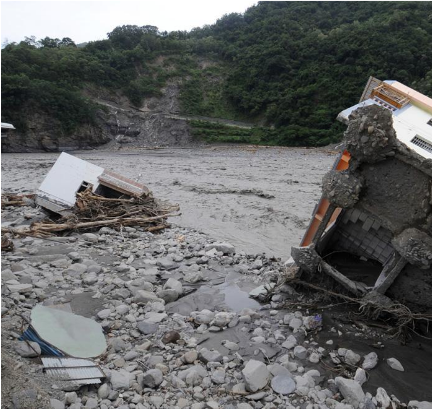
32 A collapsed apartment block lies on a river bed in Taimali, in southeast Taiwan 's Taitung county on August 10, 2009. #