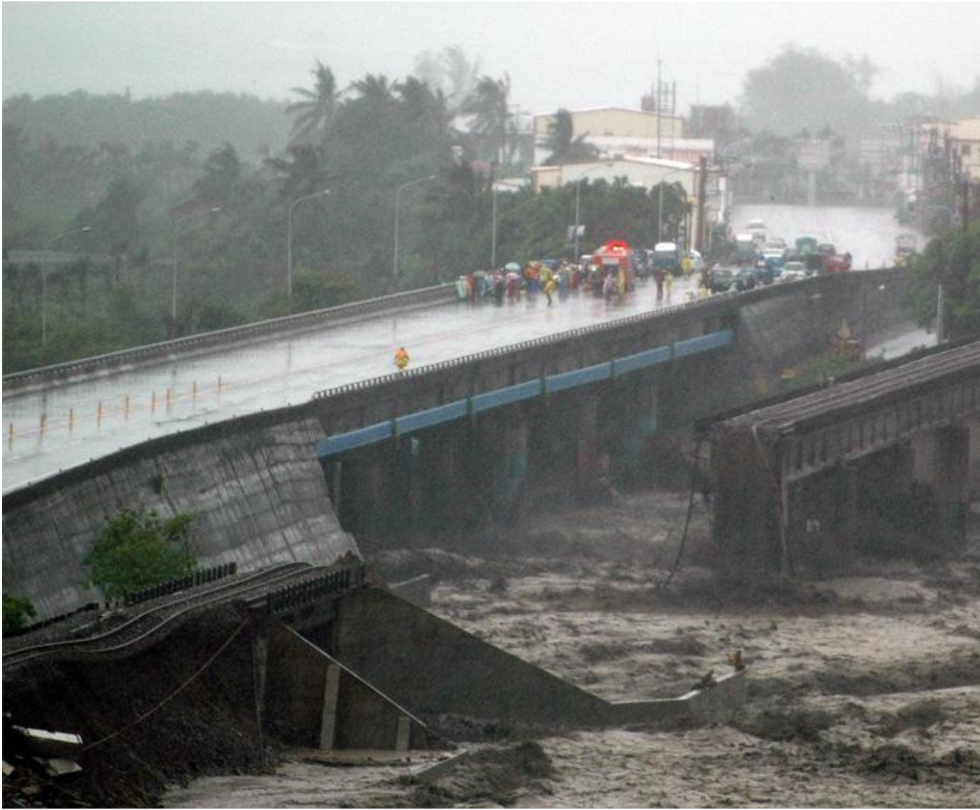
26 A railroad bridge damaged by Typhoon Morakot is seen in Taitung, eastern Taiwan August 8, 2009. #