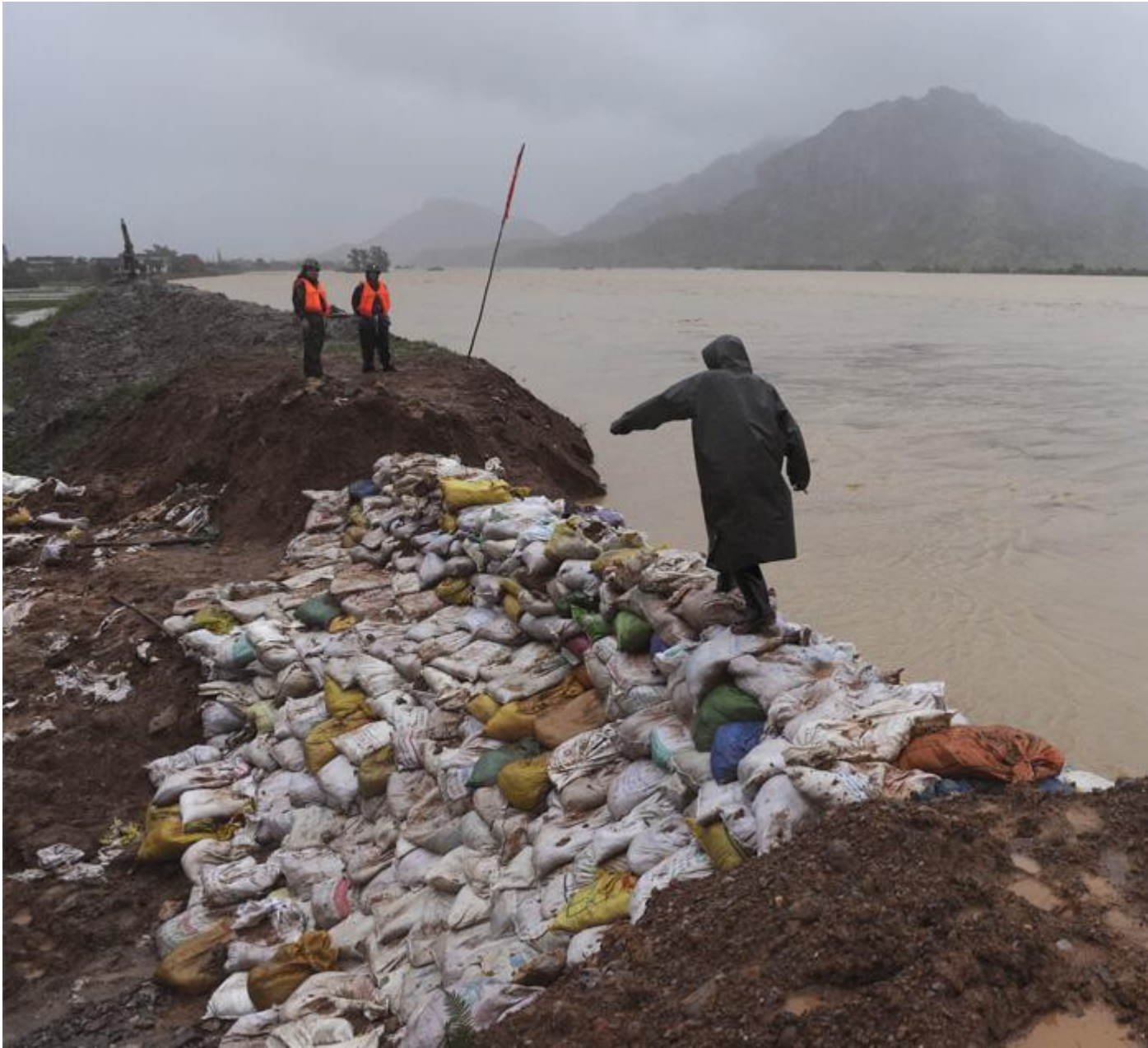
35 A man walks on sandbags used to patch a damaged dike holding back a rising river in a flooded village in Cangnan county, eastern China Sunday Aug. 9, 2009. #