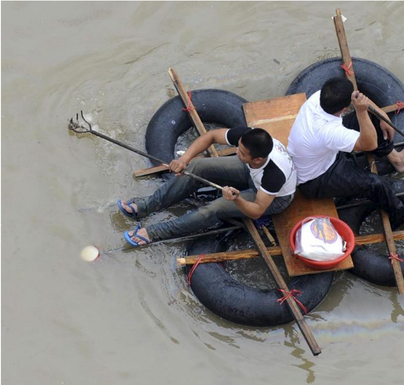
22 Residents make their way across a flooded street on a makeshift raft after Typhoon Morakot hit Cangnan county of Wenzhou , Zhejiang province, China on August 10, 2009. #