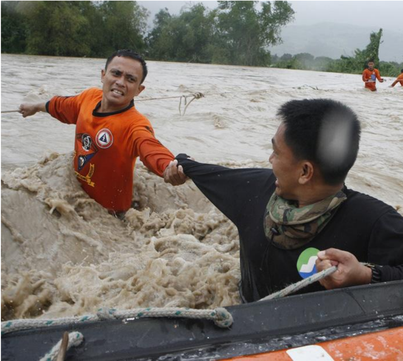
20 A Philippine Coastguard rescuer helps a colleague while crossing a flooded area with strong current in Botolan town in northern Philippines August 7, 2009. The town of Botolan was submerged in floodwaters on Friday after a dike collapsed at the height of Typhoon Morakot. #