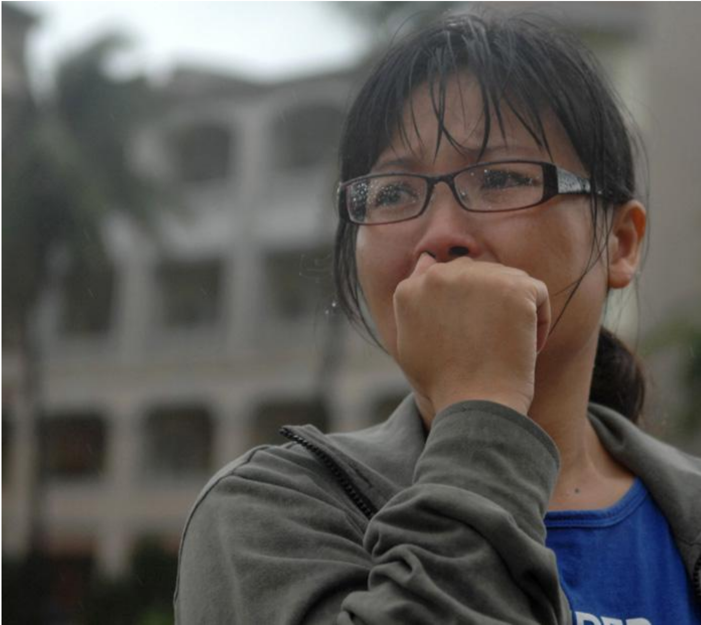
24 A distraught woman waits for word of her missing father from Shiao Lin village, which was covered in a landslide from Typhoon Morakot in Kaohsiung county, southern Taiwan , at a rescue landing zone on Monday, Aug. 10, 2009. #