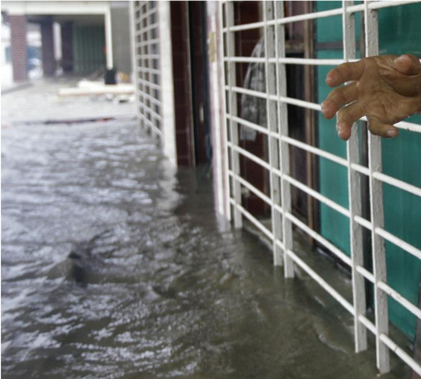
31 A man trapped by floods gestures at rescuers delivering food and drinking water after Typhoon Morakot hit Pingtung county, southern Taiwan August 9, 2009. #