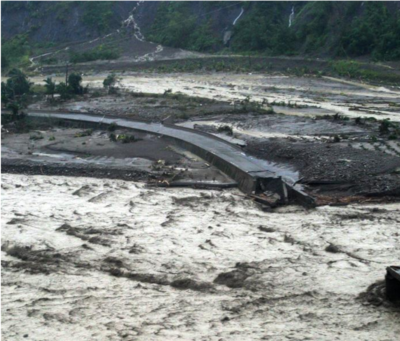
18 A storm-damaged bridge in Chiashien, southern Taiwan 's Kaohsiung county, seen on August 10, 2009. #