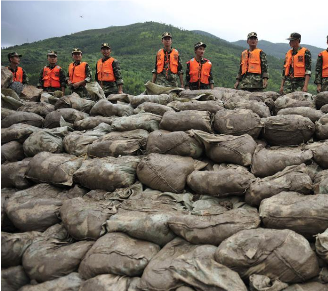
10 Paramilitary policemen stand on a pile of sandbags at a section of Yangjia Stream of Xiapu county in Ningde , Fujian province August 10, 2009. #