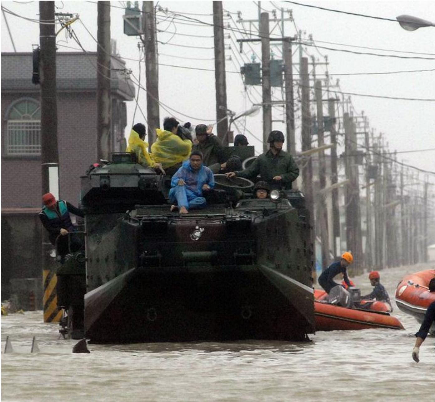
21 Evacuees sit on top of a military vehicle as rescuers search the flooded area for people after rains brought by Typhoon Morakot inundated the area in Chiatung, Pingtung county, in southern Taiwan , on August 9, 2009. (PATRICK LIN/AFP/Getty Images) #