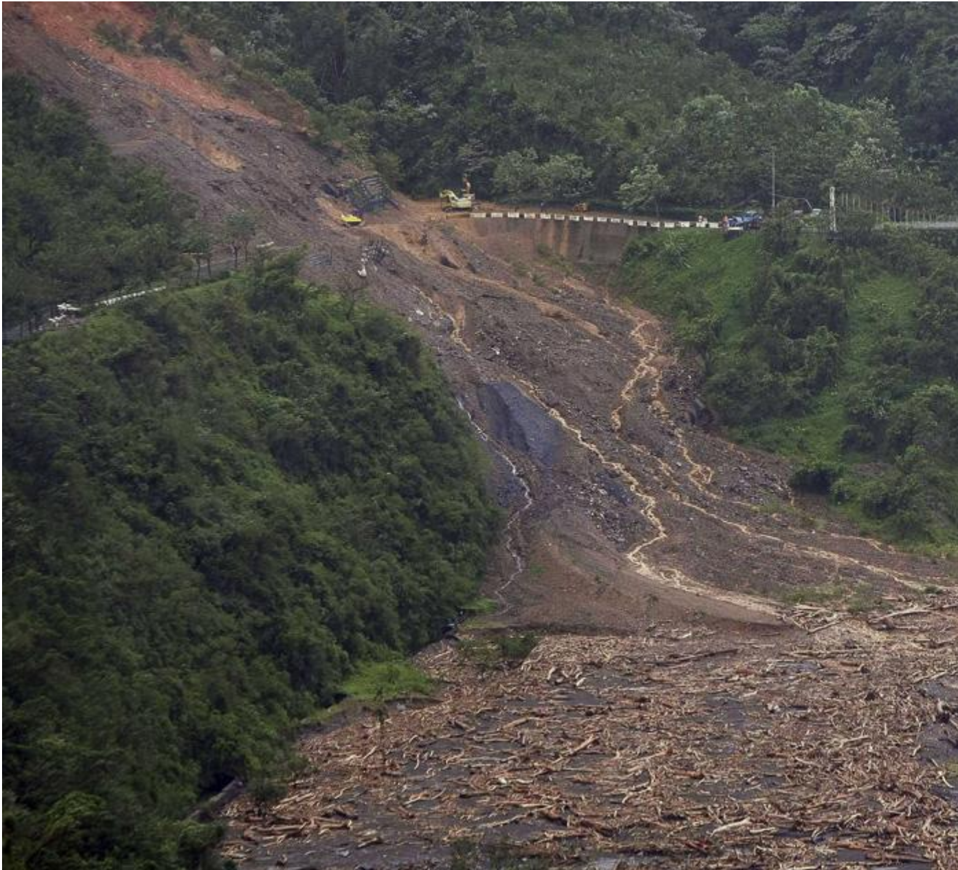
17 A massive landslide is seen across a mountain road in Pingtung county, southern Taiwan , Monday, Aug. 10, 2009. #