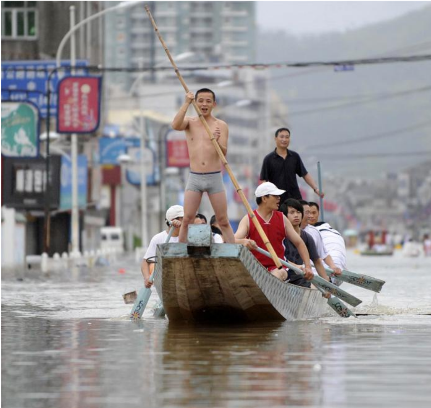
25 People row a dragon boat to commute through a flooded area in Cangnan county, in east China's Zhejiang province, Monday Aug. 10, 2009. #