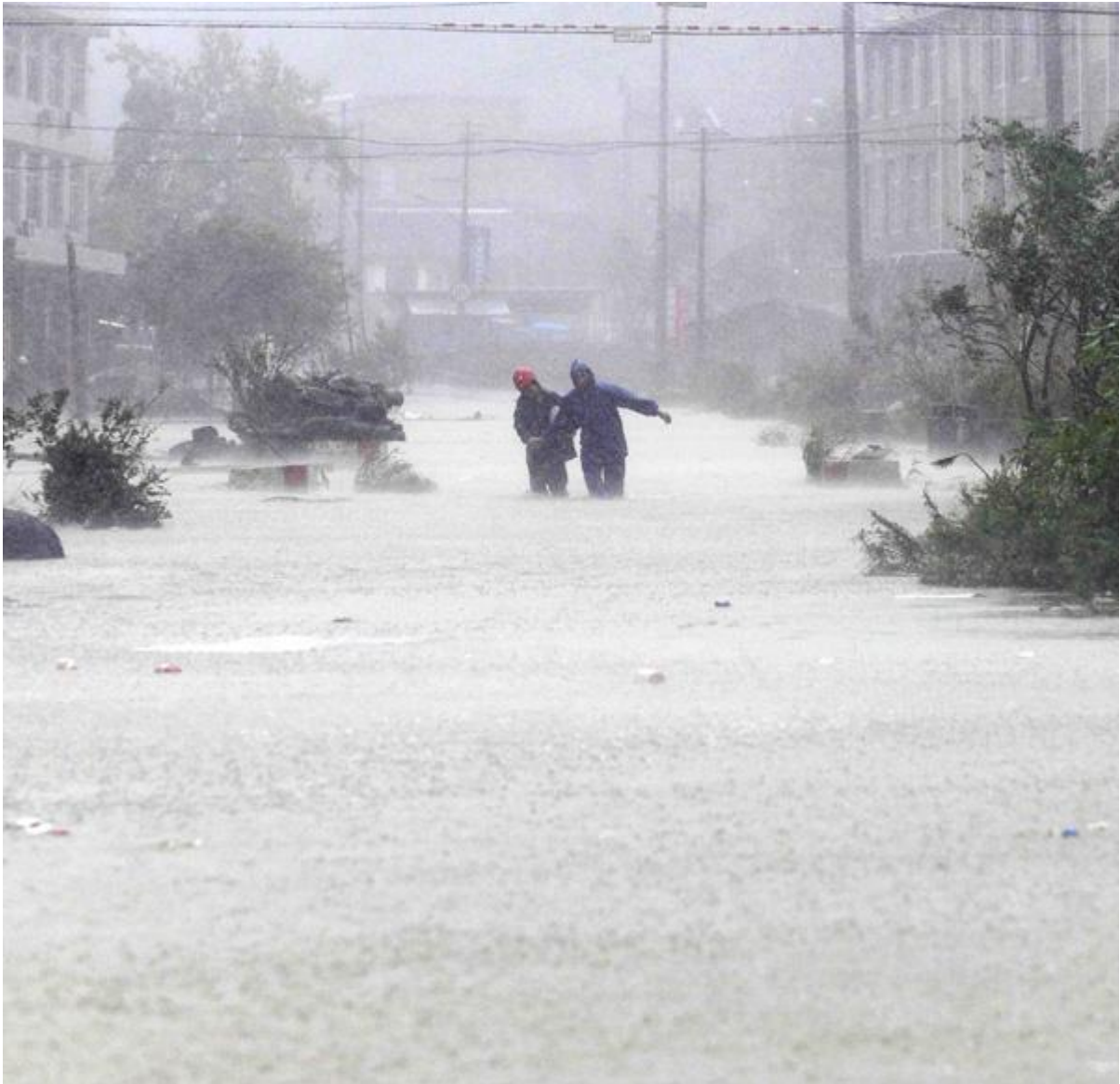
3 Two villagers walk in a flooded village in Cangnan county, eastern China Sunday Aug. 9, 2009.. #