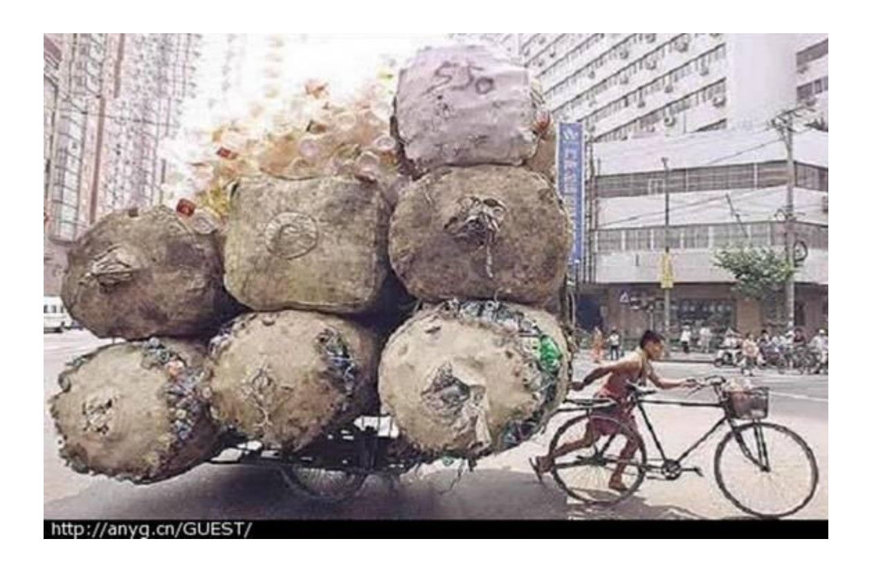
Once again if you think that the bus is too late, think of this...