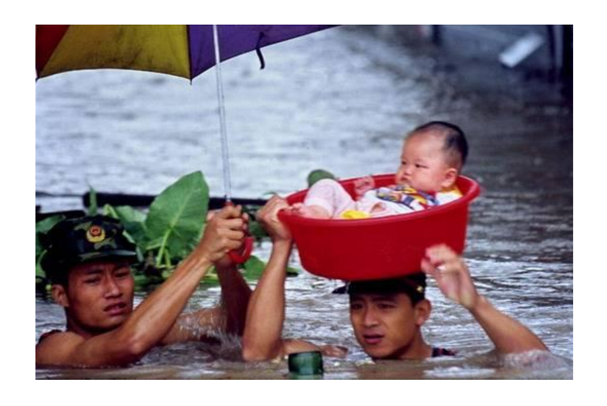
If you think that you're not earning enough, then have a look at this...